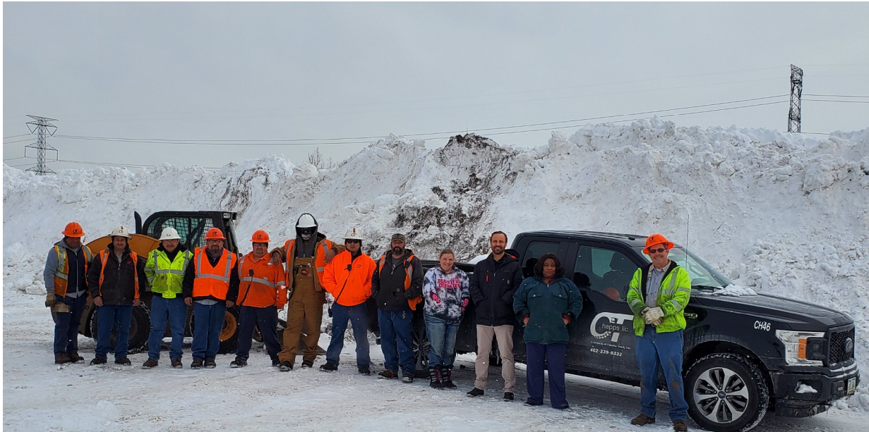
Our OTC Crew standing by their snow mountain, 2/2021

Winter is snow much fun! Chicago has been a snowy war zone with 5'4" icicles hanging around and literal snow mountains. From October through January 26, the city had a cumulative total of 8.6 inches of snowfall. Since January we have had a number of major snow storms impact the area. The City on average sees about 36 inches of snow in an entire winter. Just in the last month alone, the city has seen 36.2 inches of snowfall.