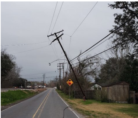
Incident on February 2, 2021

On 2/8/21- A Brandt truck contacted an overhead power line. Remember to ensure we are clear of overhead power lines. If an energized power line contacts the ground, stay in the equipment if safe to do so.