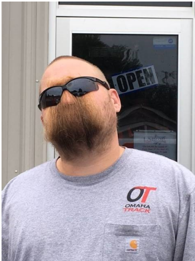
"Led" with his impressive face covering