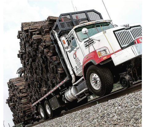
Submitted by: Joe Janz