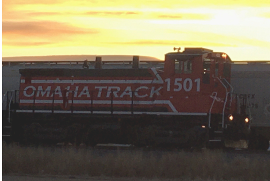
Submitted by: Jimmy Edwards