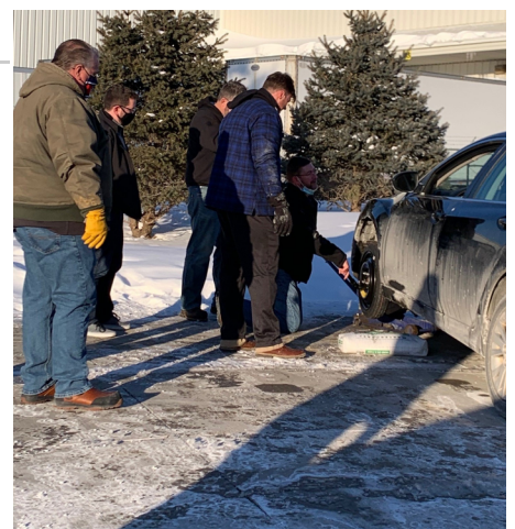
Office Team changing a tire for their co-worker

Please send all employee submissions to: newsletter@omahatrack.com